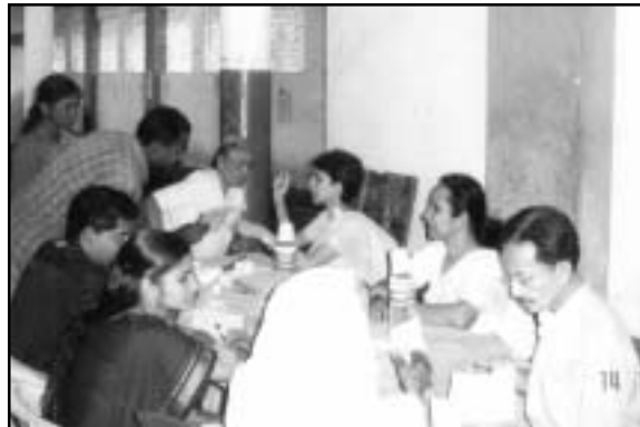
A scene from TACO camp

TACO celebrated 'The World Sight Day' on 12 th October in a grand