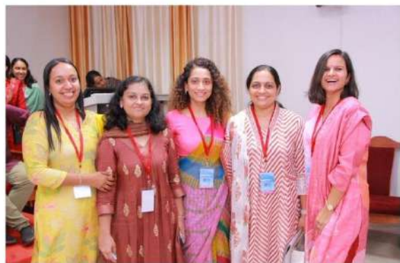
EyeCancerConnect CME on ocular oncology by MCC Thalassery under the aegis of OSK and KSOS