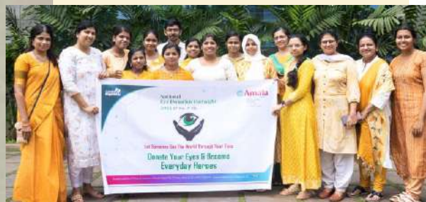
Eye Donation Promo Skit by residents & staff and the enraptured audience