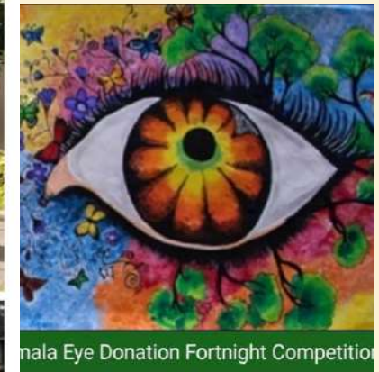
Amala Eye Donation Fortnight Competition